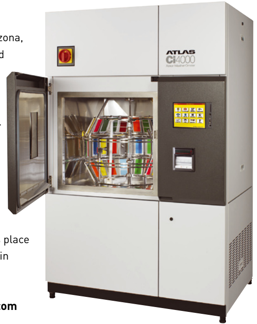
The latest Atlas sample holder can handle a wide range of specimens

Reproduced with permission from Compounding World (www.compoundingworld.com) LW-6046