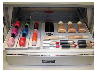
Bottles and other oddly-shaped samples can be easily tested in a Q-SUN chamber due to its flat specimen tray and variety of mounting options.

Although chamber relative humidity may not be critical for testing drug substances enclosed in packaging or test bottles, the Q-SUN Xe-3 provides precise control of RH for tests that may benefit.