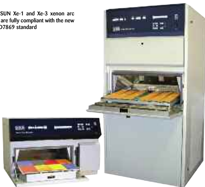
The Q-SUN Xe-1 and Xe-3 xenon arc testers are fully compliant with the new ASTM D7869 standard

ASTM D7869 addresses this problem with a much tighter