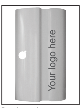
Panels can be customized in dozens of different ways, such as adding your company's logo.