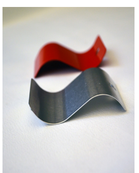
Custom panels in complex shapes can be created with a small minimum order size.