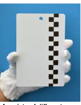
A variety of different prepainted, patterned and other custom panels can be made upon request.