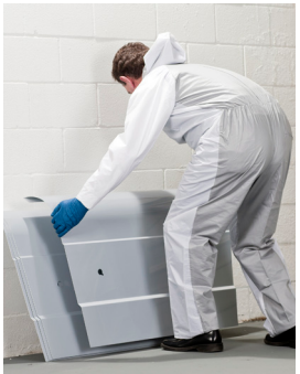
The Q-PANEL automotive refinish training system is a cost-effective simulation of hoods and fenders.

These custom panels are most cost-effective when there are quantities sufficient to allow an economical production run, and when the material is available from our stock metal or readily available alloys. Contact Q-Lab with your custom panel specifications now!